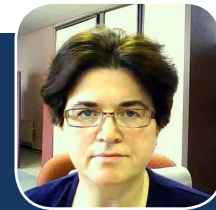
by Pauline Biggane

The Health Service Executive (HSE) is the government agency responsible for the provision of public healthcare services for everyone living in Ireland. The HSE now requires that all surgical instrument trays are identified using GS1 Standards to enable stakeholders to track and trace them throughout the supply chain. The system currently being rolled out is designed to create a collaborative, interoperable, and nationwide traceability solution for Central Decontamination Units.