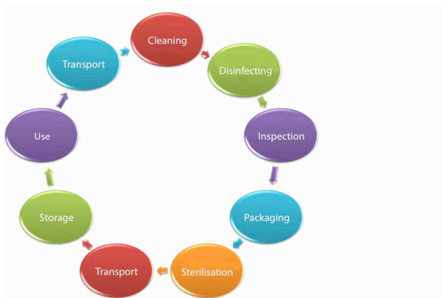
Figure 1: The Decontamination Cycle

The supply and demand chains for surgical instrument sets are complex. There are two distribution channels needed to get the product to the end user: a surgeon or another medical professional. Firstly there is the macro supply chain; when an instrument set is loaned between hospitals or when it is loaned or consigned to a hospital from a commercial loan set provider. Secondly there is the micro distribution channel; the decontamination process that occurs within the four walls of the CDU. Importantly, continuity of traceability between these two supply chains is a key factor in ensuring patient safety.