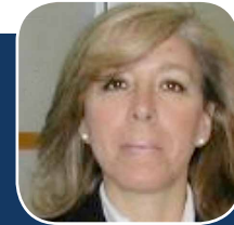
by Margarida Alves

In 2010, Novartis Pharma in Portugal developed and implemented a traceability programme using GS1 2D DataMatrix. This programme allows to track the product, from the warehouse to the patient, including all the moves in the hospital from the pharmacy to the operating theatre. It also enables online status checks in the case of an adverse event or any investigations due to quality aspects. The programme is set up to include other products and is being adopted by other countries.