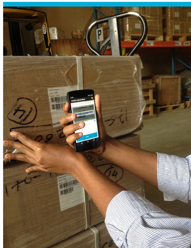
In Ethiopia, a team member at the Addis Ababa central warehouse uses a mobile phone app to scan bar codes on shipping boxes when receiving incoming goods.

The Ethiopia experience more realistically demonstrated what full E2E bar code track and trace could look like: A digital cargo manifest identifier is encoded in the bar codes at the tertiary-level shipper boxes. Upon arrival of the shipment, the receiving party can digitally