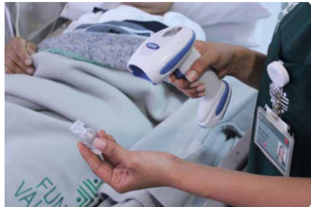
Scanning the barcode of the medicine.

With GS1 standards, Valle del Lili now has a traceability solution that allows the hospital to improve operational efficiency and increase its competitiveness in providing healthcare services.