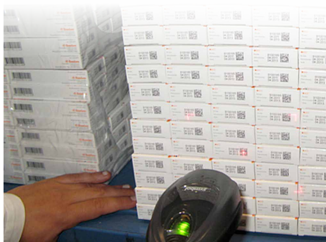
Figure 4: Serial numbers being checked

A first test was undertaken to prove the authenticity of the medicines . 118 scans of Serial Numbers were conducted on inventory held at the wholesalers and pharmacy locations (Figure 4), as well as at the dispensing point in pharmacies. The manufacturers verified the Serial Numbers and confirmed that no duplicates had been found at the points of dispensing.