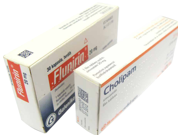
Figure 1: Marked products with GS1 Standards

Accordingly, the wholesalers developed the ability to improve the warehousing processes by monitoring the products GTIN, Batch or Lot Number and Expiration Date.