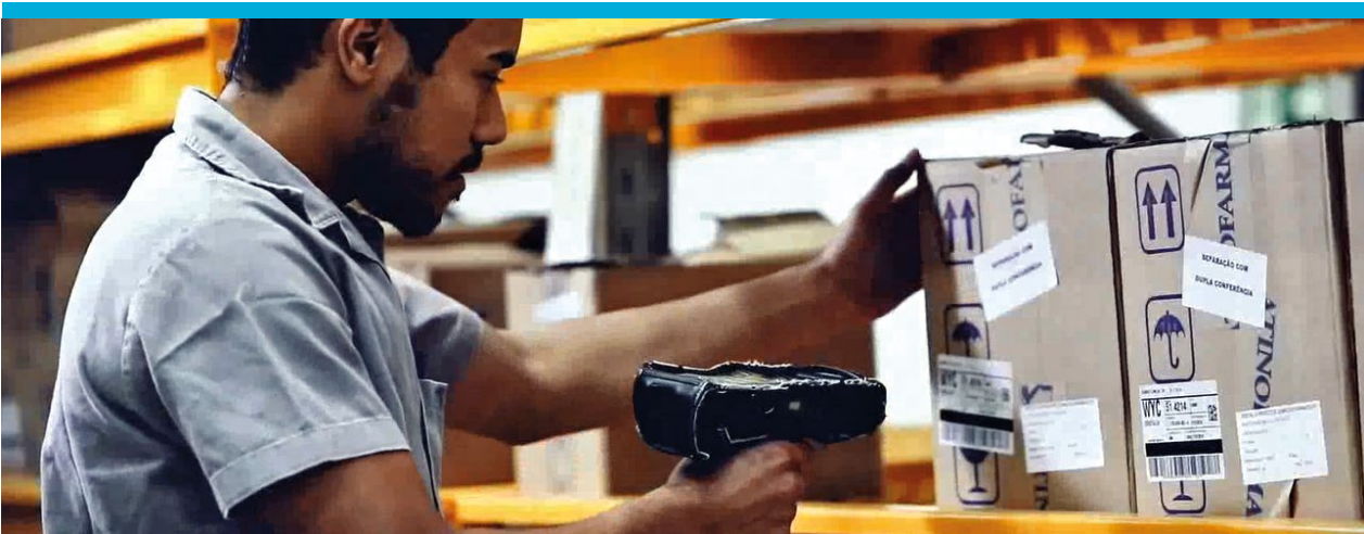
As products are received by CAISM, GS1 barcodes are scanned to confirm receipt of the products in the hospital's inventory system.