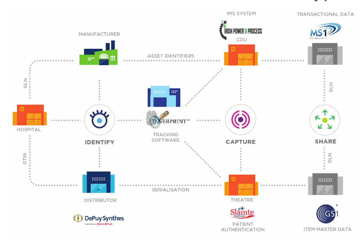
Figure 2: The Use of GS1 Standards in Surgical Instrument Traceability Systems

The traceability chain is also maintained when an instrument tray is loaned between hospitals using the track and trace system. When a hospital borrows an instrument set, they simply scan the GS1 bar code which acts as the key to access the relevant information. The details associated with each particular instrument set can then be downloaded to the local systems, maintaining traceability data and ensuring accurate data on the contents of the set. Prior to the adoption of GS1 Standards this was a paper-based, error prone, and labour intensive process.